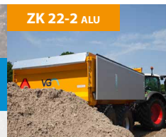
ZK 22-2 ALU